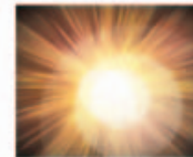
There is evidence to suggest that the Big Bang theory is valid.

The Big Bang theory has led to many other theories and predictions in science. In the 1940s, physicist George Gamow realized the early universe must have been extremely hot and dense. As the universe expanded it would cool down and the initial hot radiation should eventually be observable as uniform radio waves throughout space. In the 1960s, Robert Wilson and Arno Penzias discovered cosmic uniform radio waves that implied a temperature of about 3 degrees above absolute zero (Kelvin). Later, technology enabled scientists to take very detailed wavelength and thermal measurements of this radiation. They confirmed that it is extremely uniform, is of the shape predicted by the theory, and has a temperature of 2.7 degrees Kelvin. This observation provides strong evidence that the Big Bang theory is valid .