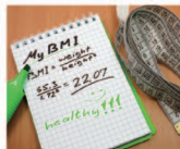
To find your BMI, you just need to know your height and your weight.

Despite these criticisms, there are strong positive aspects of BMI. The main one is that it is very simple. The formula can be used easily and does not take special knowledge or equipment—just a scale, along with pencil and paper or a calculator . Though BMI is a general measurement, it still gives useful information and can help identify when there might be a problem. Furthermore, some studies have shown that people with higher BMI numbers have a higher risk of health problems. It takes only a minute to get a BMI number, but the results can be very important to a person's life.