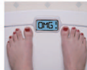
Just knowing your weight does not give you enough information.

To be obese means to have too much fat on the body. Obese people are not just overweight—they are so overweight that they are likely to develop health problems. The precise cause of the recent rise in obesity is not clear, but it is certain that obesity is a problem in most countries. One study estimated that about fifty-five percent of people in the United States are obese. People need to understand what obesity is and how to tell if they the so that they can change their condition.