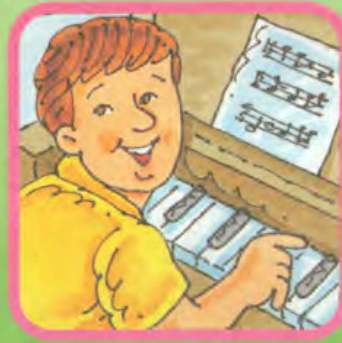
6 music teacher