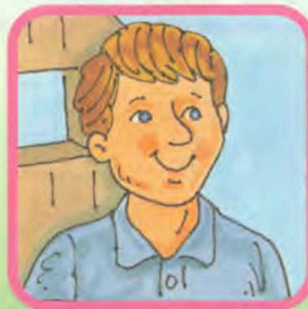
3 gate keeper