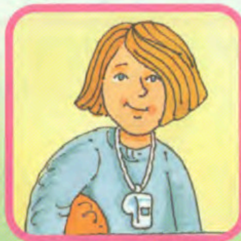
2 gym teacher